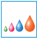
Piezo Variable Drop